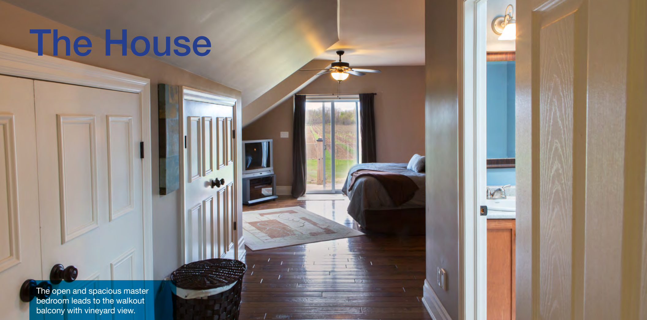
The open and spacious master bedroom leads to the walkout balcony with vineyard view.