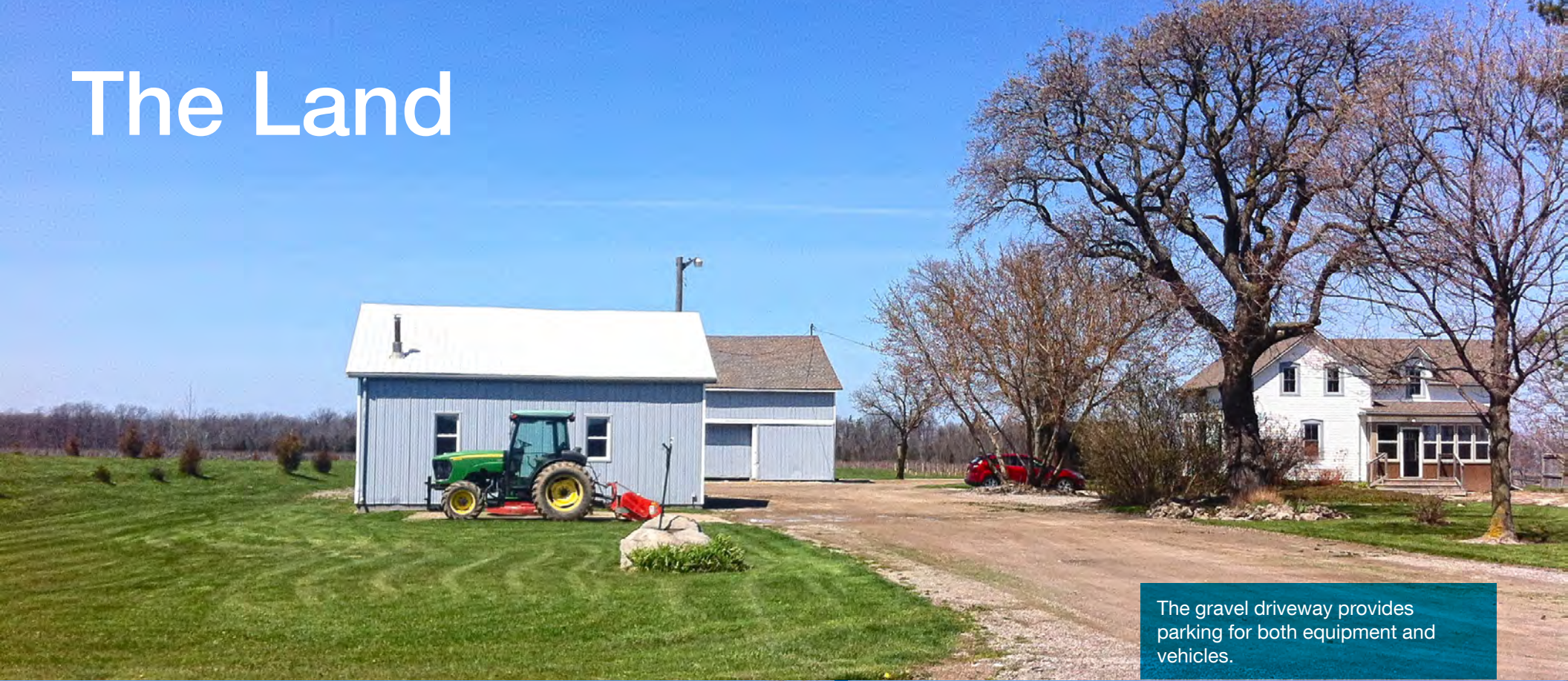
The gravel driveway provides parking for both equipment and vehicles.