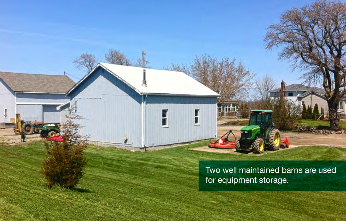
Two well maintained barns are used for equipment storage.