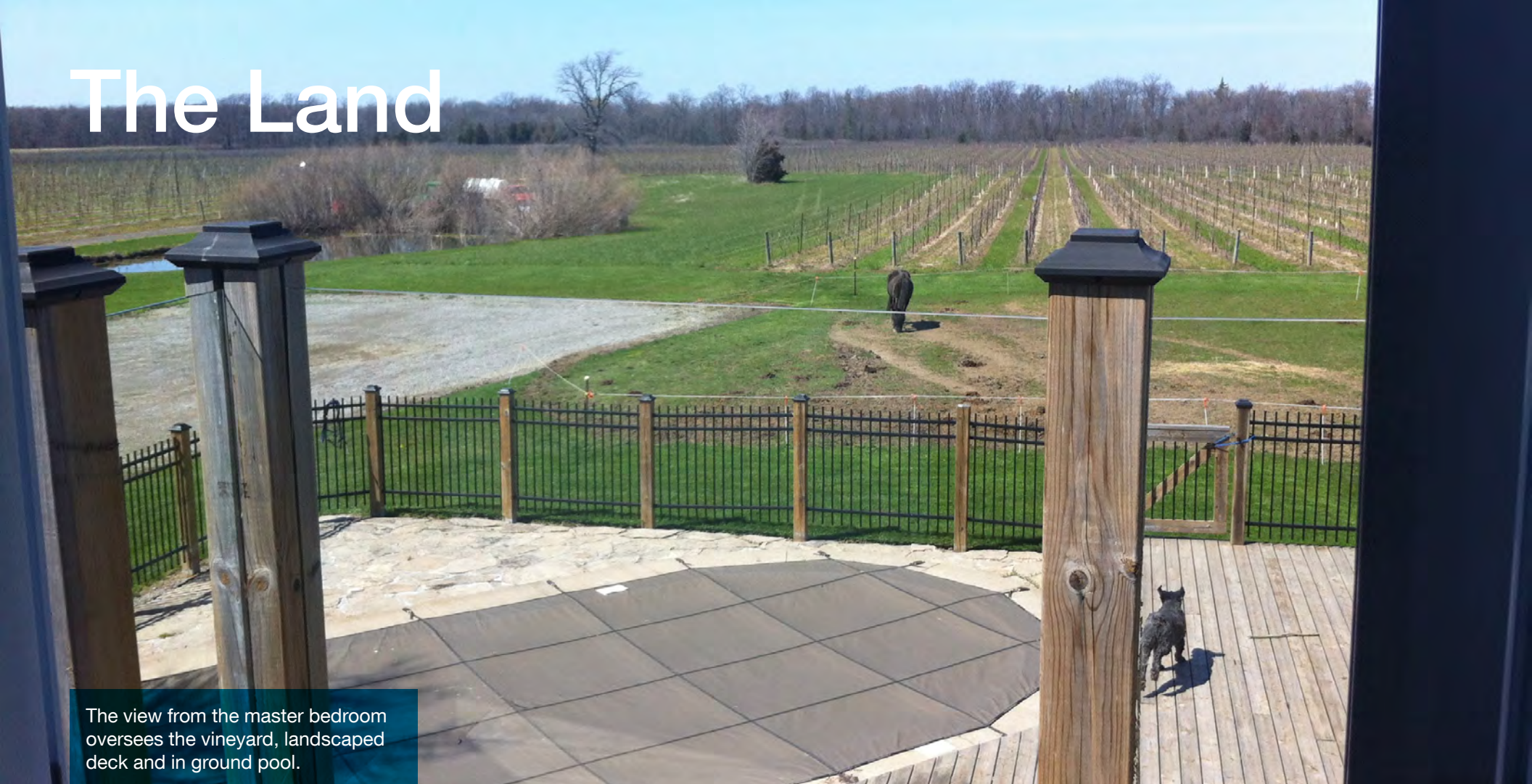
The view from the master bedroom oversees the vineyard, landscaped deck and in ground pool.