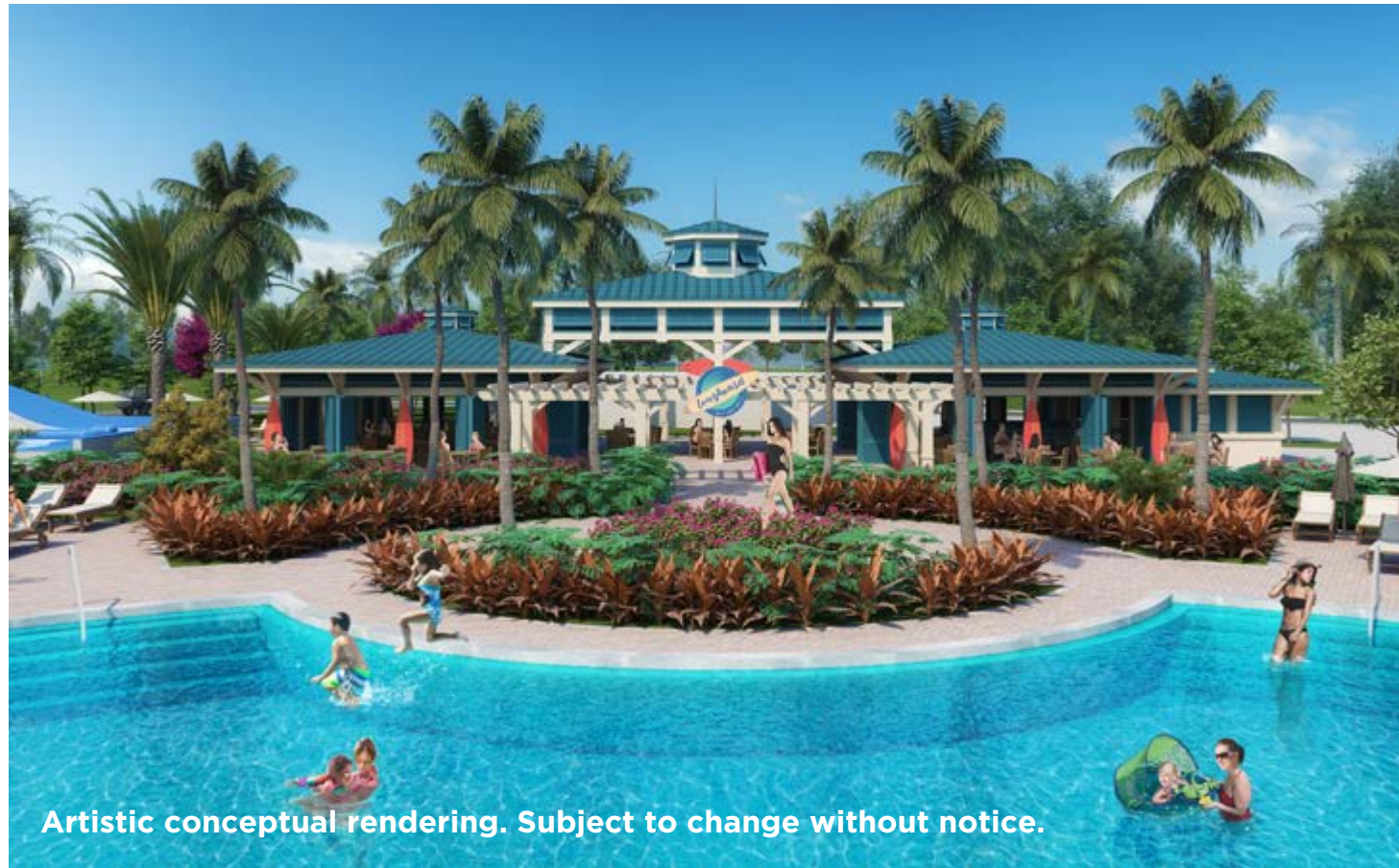
Artistic conceptual rendering. Subject to change without notice.