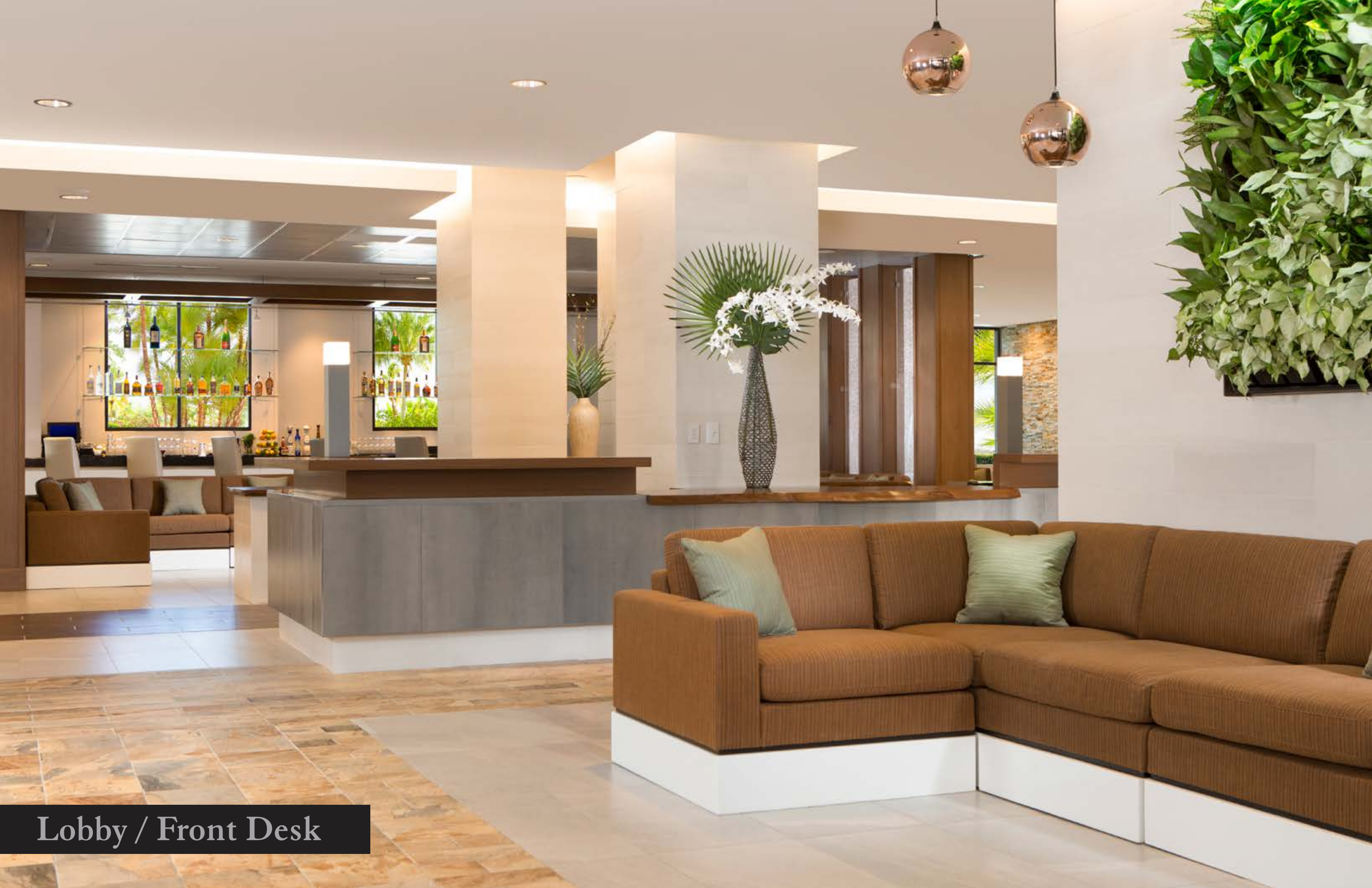
Lobby / Front Desk