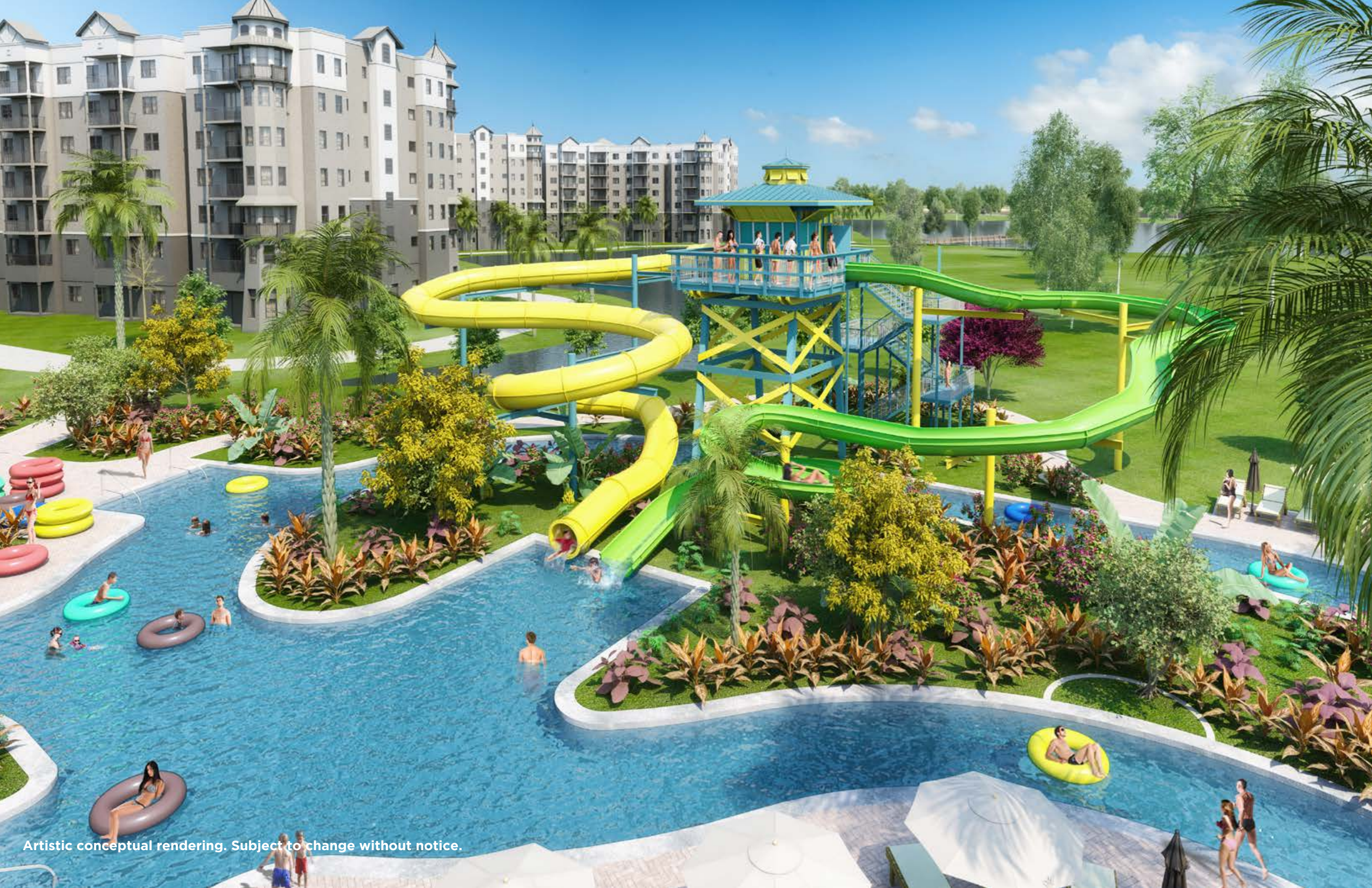
Artistic conceptual rendering. Subject to change without notice.