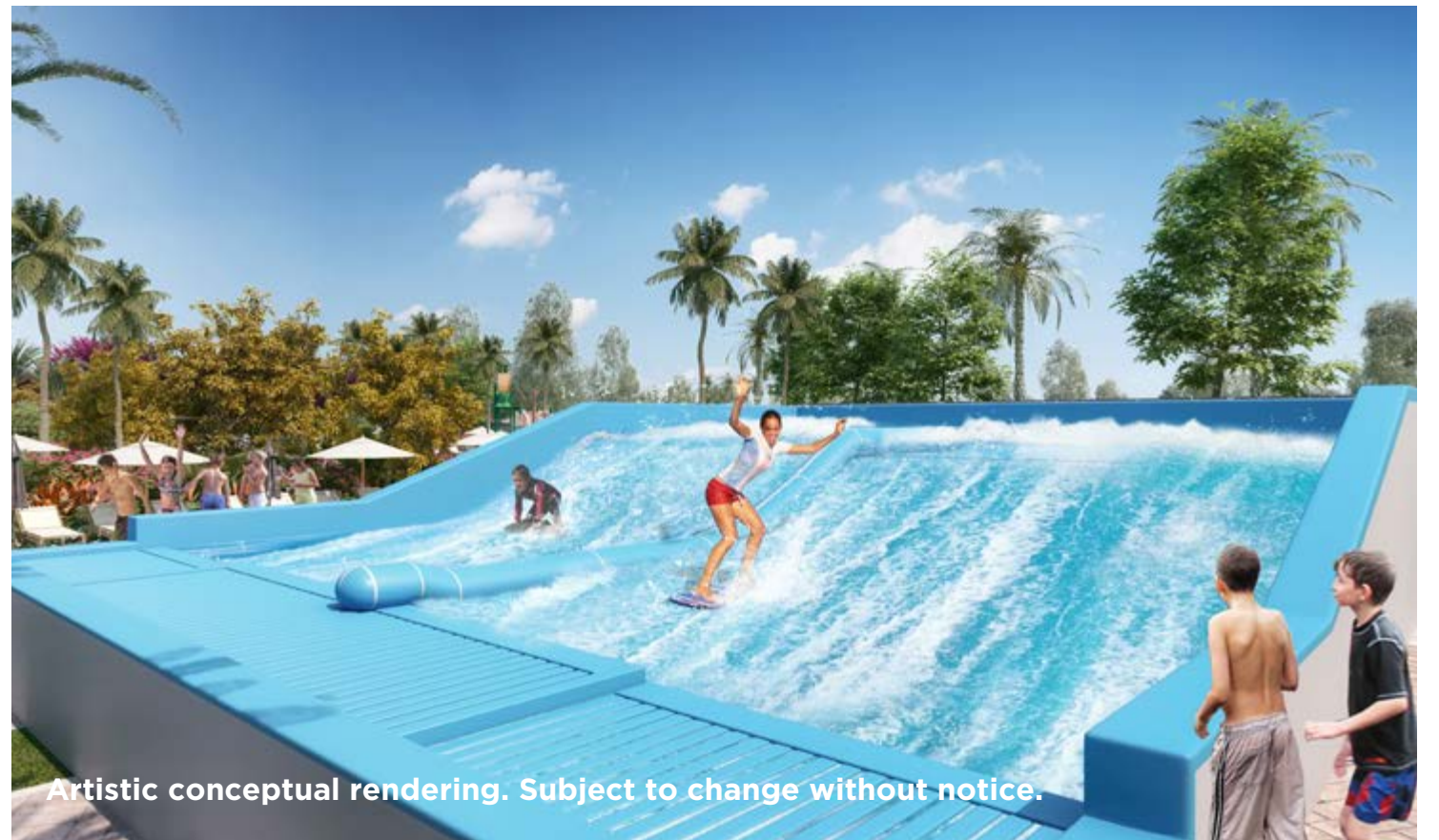
Artistic conceptual rendering. Subject to change without notice.