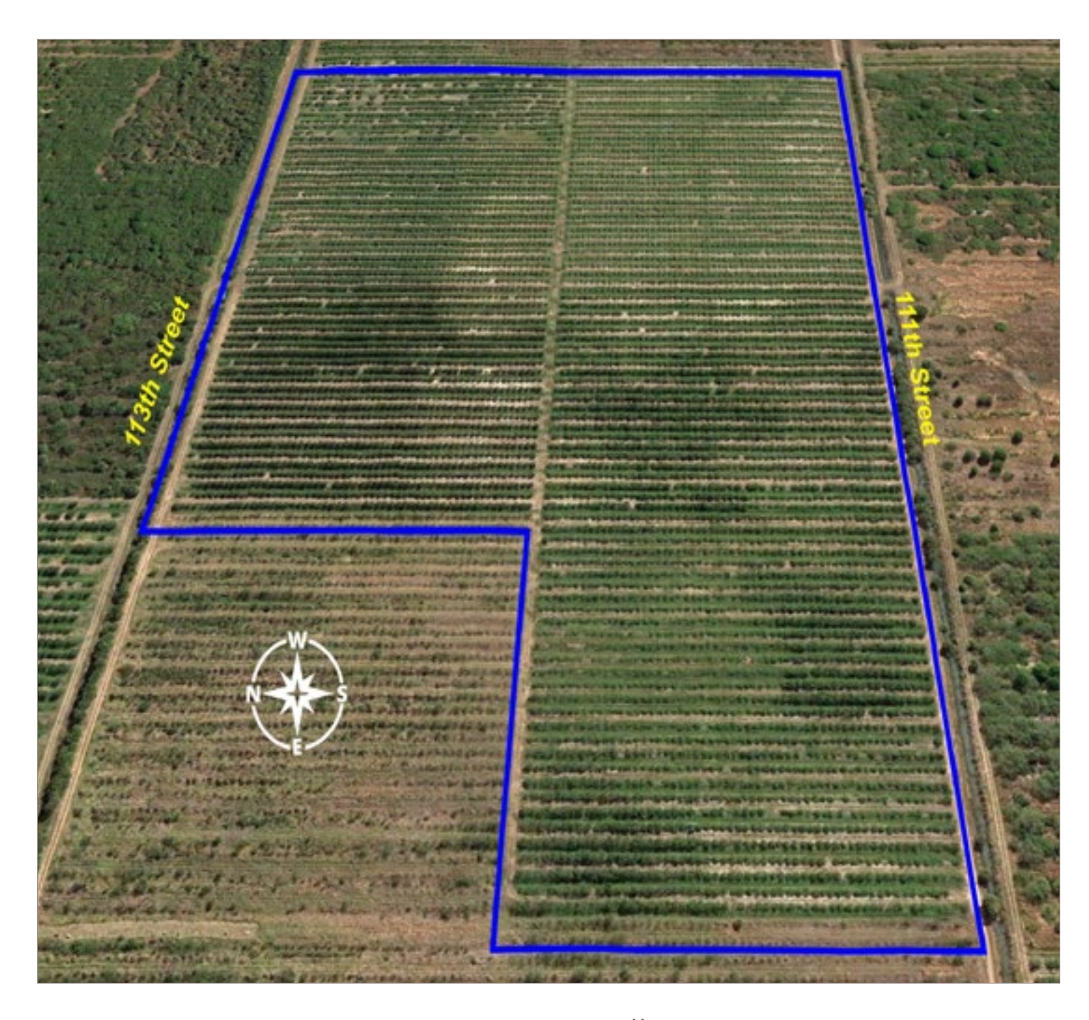
Morton Grove Fellsmere AERIAL